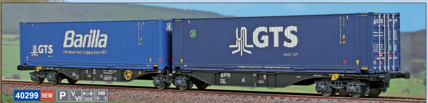
"Il treno della pasta". Carro bi-modulo da 90 piedi GTS con casse mobili "Barilla" e "GTS". "Pasta train". Container wagon Type Sggmrss '90 GTS with "Barilla" and "GTS" containers. "Der Nudel-zug. 90-Fuß-GTS-Bimodul-Wagen mit Barilla- und GTS-Wechselpritschen.