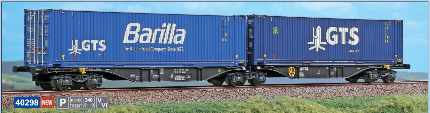
"Il treno della pasta". Carro bi-modulo da 90 piedi GTS con casse mobili "Barilla" e "GTS". "Pasta train". Container wagon Type Sggmrss '90 GTS with "Barilla" and "GTS" containers. "Der Nudel-zug. 90-Fuß-GTS-Bimodul-Wagen mit Barilla- und GTS-Wechselpritschen.